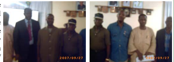
Some of the newly elected executive members