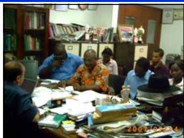
Infotech/Library Committee members in a meeting