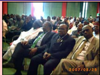
Participants at the assembly

The Assembly noted the roles of science, engineering, Technology and Innovation (SETI) in meeting the goals of development in Nigeria and that these must be placed at the heart of policies to promote sustainable