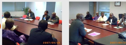
ERC Committee members with ELF Team