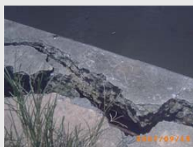
Crack on the NLNG bridge