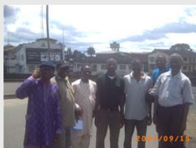
Members of the committee

The public is advised to take alternative roads to Amadi-ama, Abuloma etc. while the Government should effect immediate repairs as the Association is ready to give professional advice in terms of design, construction and consultancy.